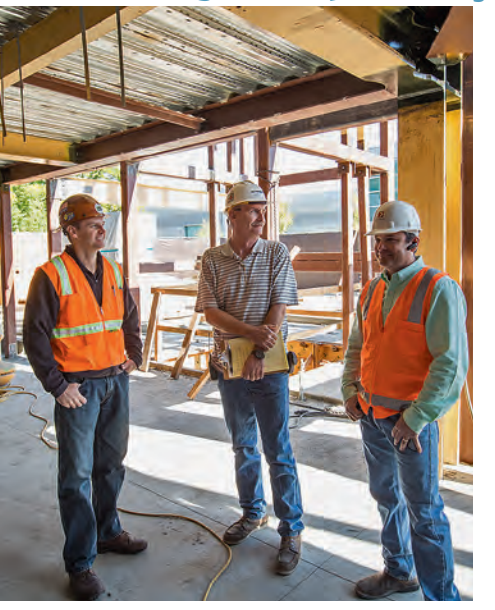
College Complex Project Updates 40-year-old Facility